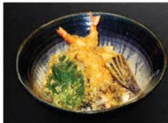
天井 Ten Don bowl of rice topped with tempura 175