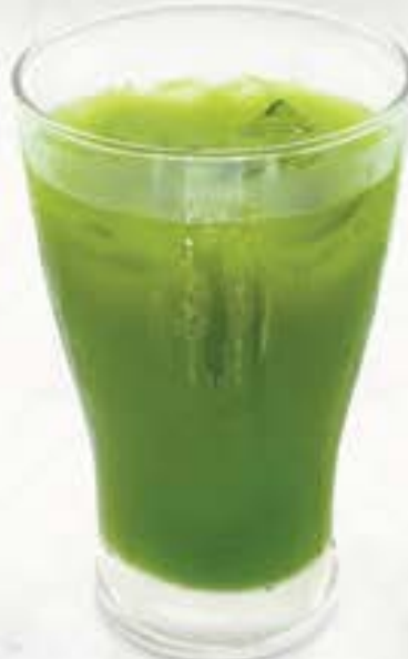
Rich Green Tea High 濃厚緑茶ハイ 130