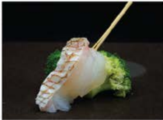
Sakana • 魚