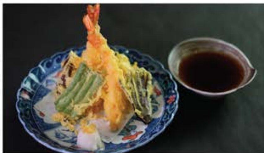
天婦羅盛り合わせ Tempura Moriwase