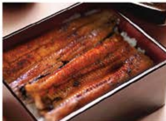
うな重 Una Jyu premium grilled tender eel on top of rice 390