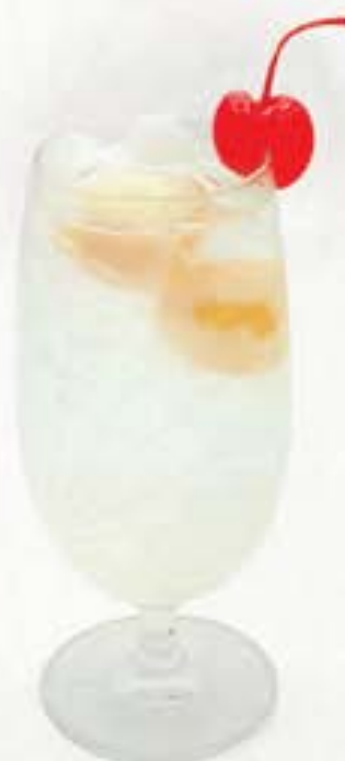
Lychee Squash レイシスカッシュ 65