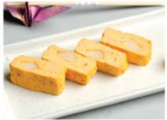
だし巻き餅玉子 Dashimaki Mochi Tamago 100

Japanese rolled omelette with rice cake fillings