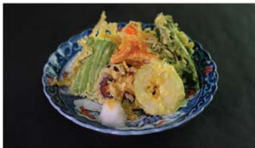
野菜天婦羅盛り合わせ Yasai Tempura Moriwase