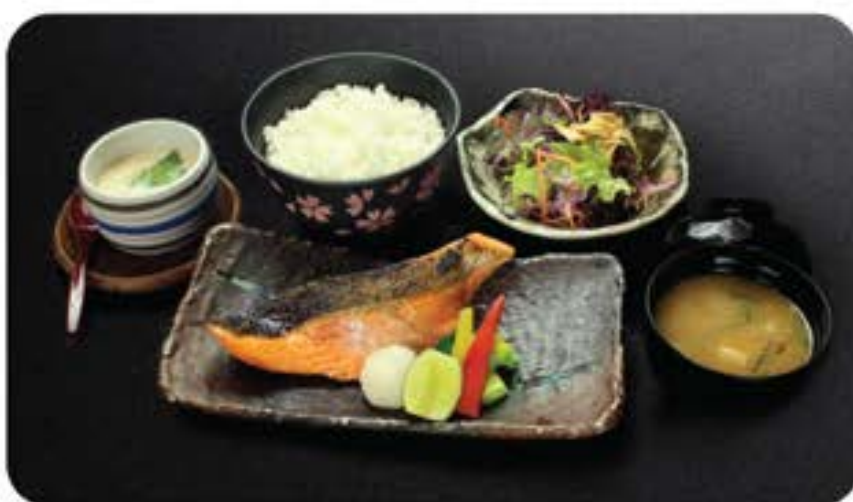
サーモン西京焼き Salmon Saikyoyaki SET

grilled salmon marinated with miso served with: rice, chawan mushi, salad, miso soup