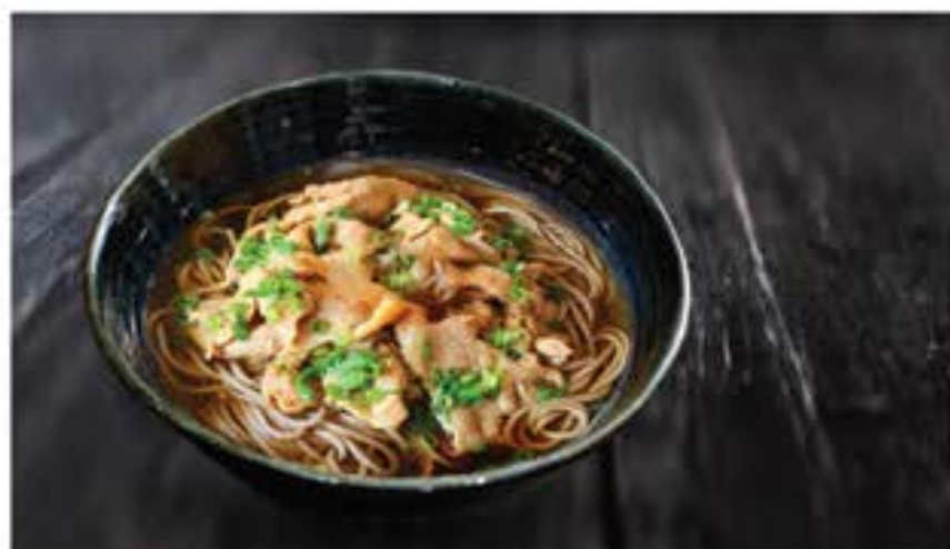
牛肉 そば/うどん Gyuniku Soba / udon beef soba or udon