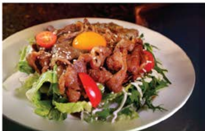
すき焼きサラダ Sukiyaki Salad