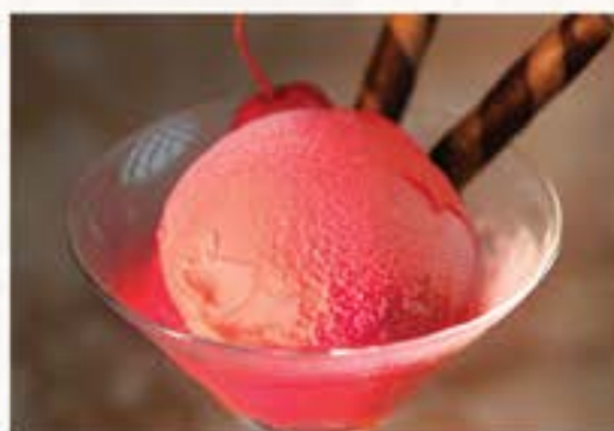
Raspberry Sorbet ラズベリーソルベ 70