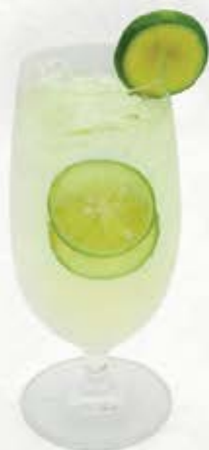
Lime Squash ライムスカッシュ 65