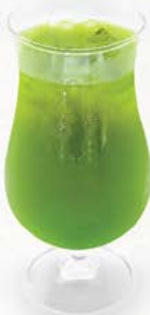
抹茶グリーンティー Matcha Green Tea 60