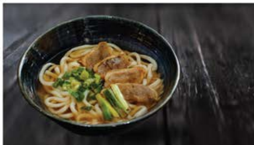
鴨南蛮そばうどん Kamo Nanban Soba / Udon duck soba or udon