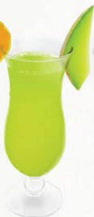
メロン Melon Juice 65