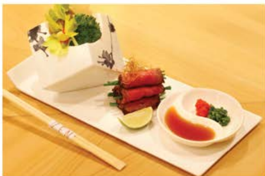
牛タタキ Gyu Tataki