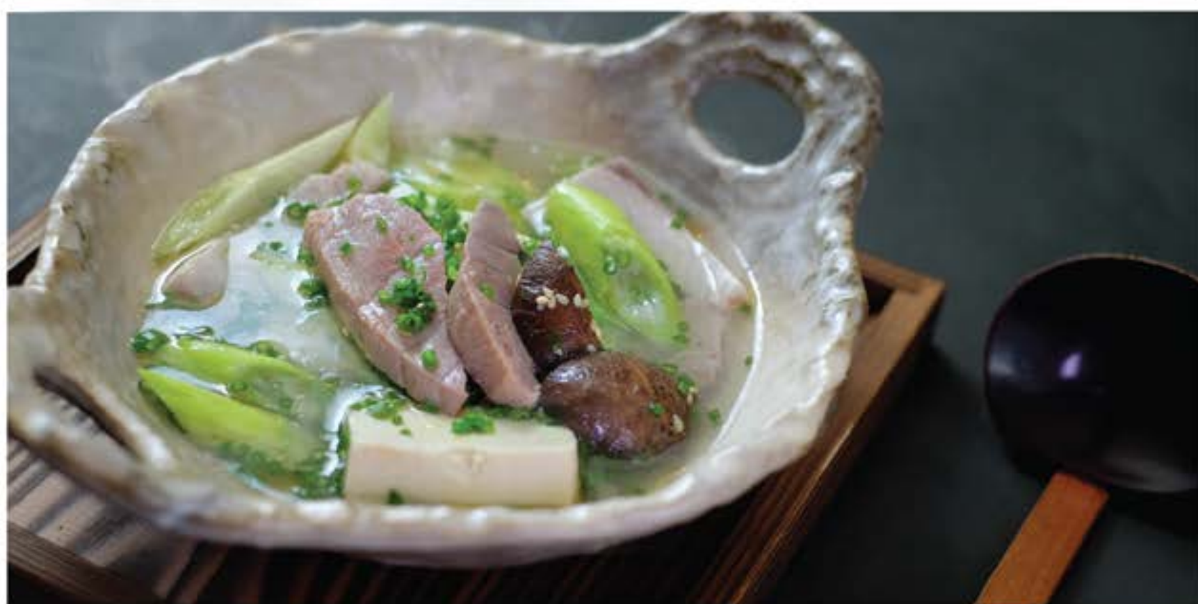
鯖のねぎまスープ Maguro no Negima Soup tuna and Welsh onion soup