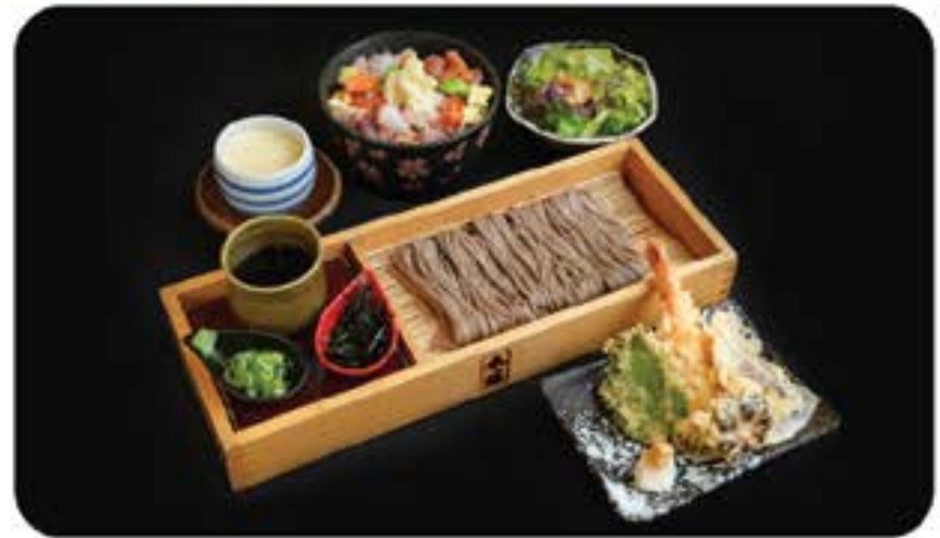
つけ天そばうどん Tsuketen Soba / Udon

(cold) tempura soba/udon with dipping soup