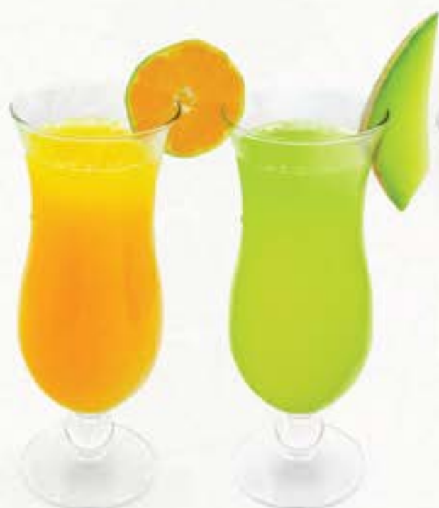
オレンジ Orange Juice 65