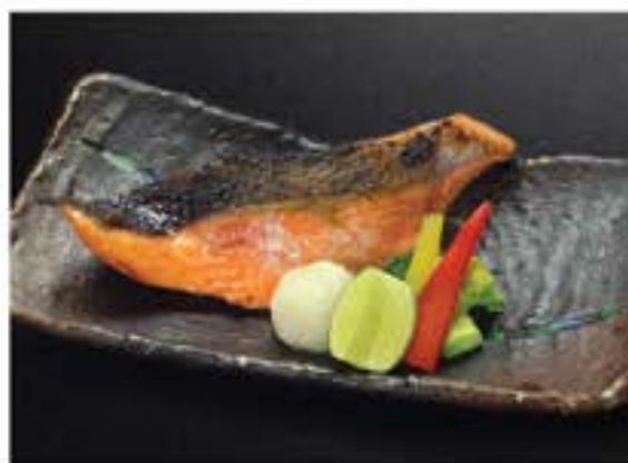
サーモン焼き <塩・照り焼き> Salmon Yaki

grilled salmon with salt /teriyaki sauce