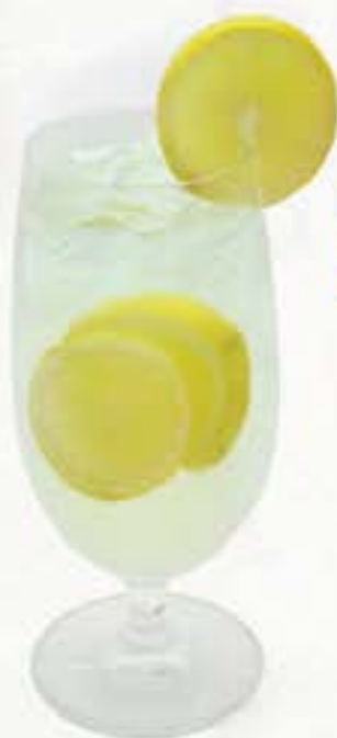
Lemon Squash レモン スカッシュ 65