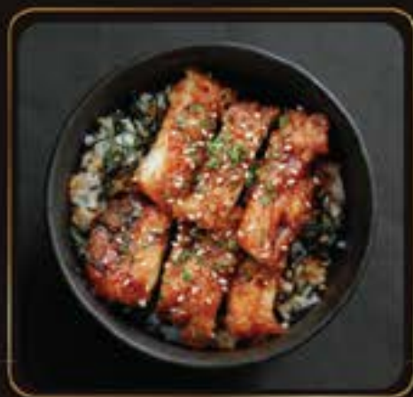
Mini Teriyaki Don