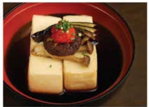
揚げ出し豆腐 Agedashi Tofu (4 pcs) 85