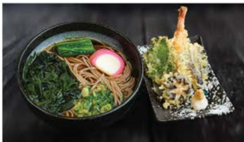
天婦羅 そば/うどん Tempura soba / udon assorted tempura soba or udon