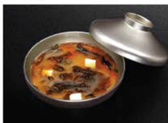
赤出汁 Akadashi 55 Akadashi soybean soup