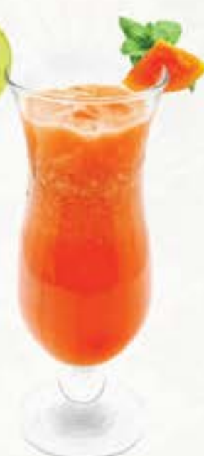
パパイア Papaya Juice 65