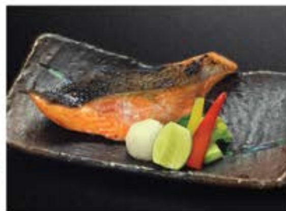
サーモン西京焼き Salmon Saikyoyaki