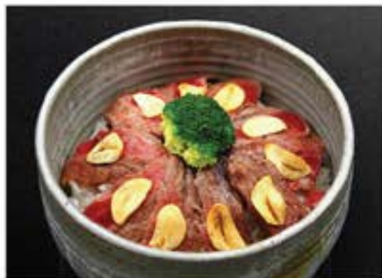
和牛丼 Wagyu Don beef with egg served on top of rice bowl 530