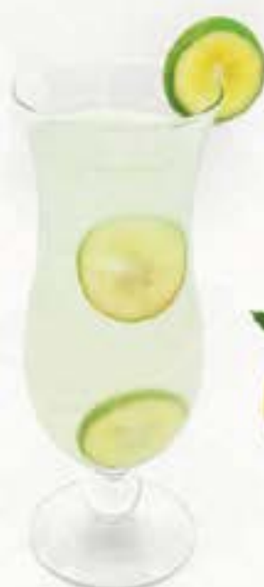
ライム Lime Juice 48