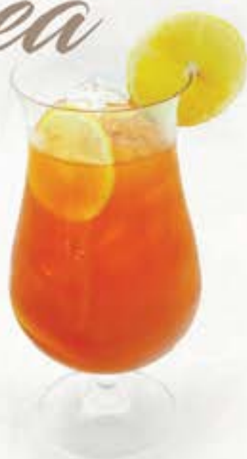
レモンティー Lemon Tea 48