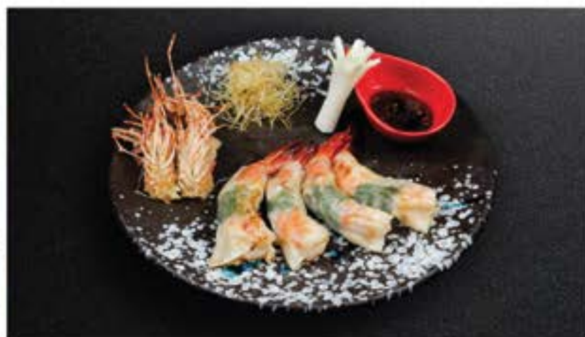
海老餃子 Ebi Gyoza