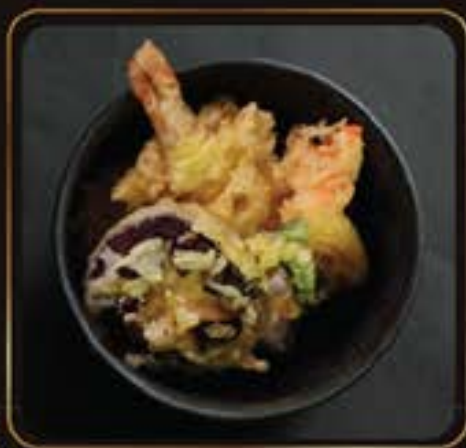
Mini Ten Don