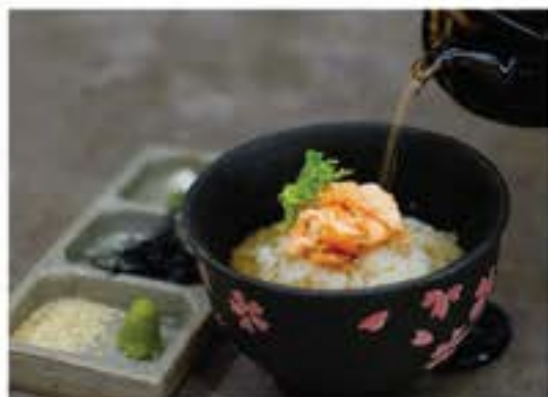
鮭茶漬 Shake Chazuke salmon and rice with tea broth 105