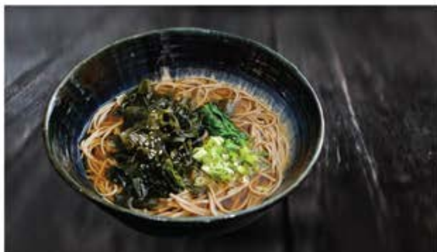
わかめ そば/うどん Wakame soba / udon seaweed soba or udon