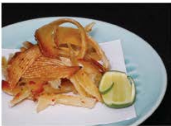
エイヒレ Eihire 195

Japanese rolled omelette with rice cake fillings