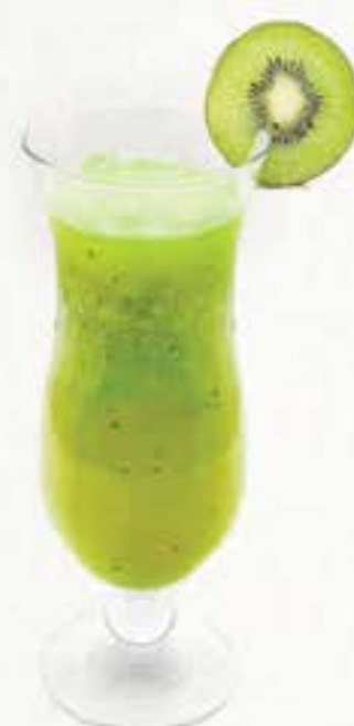
キウイ Kiwi Juice 85