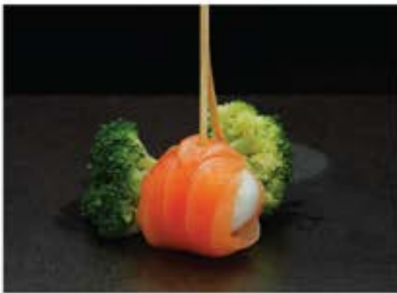
• Salmon Uzura Tamago • サーモン鞠玉子