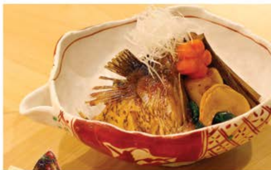
鯛兜山椒煮 Tai Kabuto