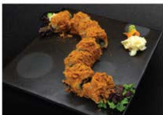
ドラゴンロール Dragon Roll