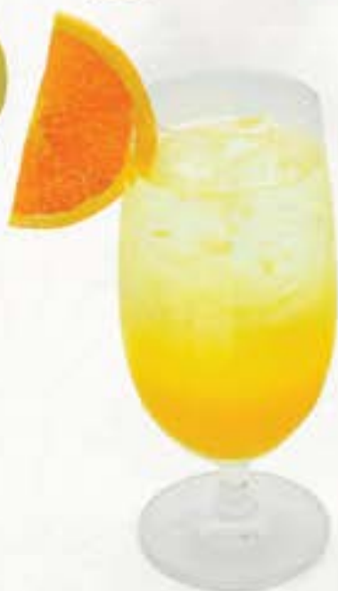
Orange Squash オレンジスカッシュ 65