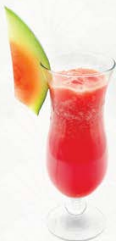
スイカ Watermelon Juice 65