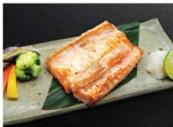
サーモンハラス炭火焼き Salmon Harashu Yaki