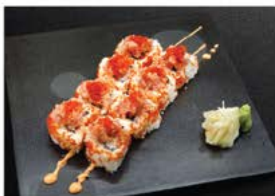
ツナロール・ スパイシーツナロール Tuna Roll / Spicy Tuna Roll