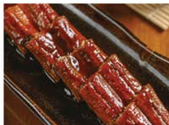
うなぎ蒲焼 Unagi Kabayaki