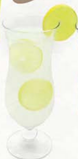
レモン Lemon Juice 48