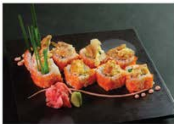
ソフトシェルクラブロール Soft Shell Crab Roll