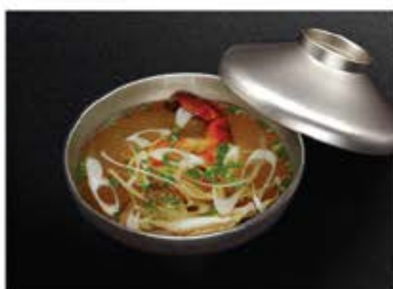
吸い物 Suimono 50 Japanese clear soup