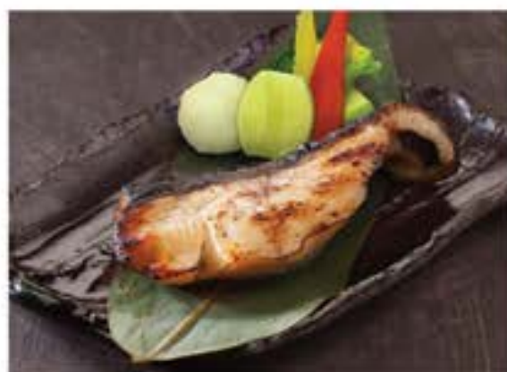
銀だら焼き <塩・照り焼き> Gindara Yaki

grilled silver cod with salt / teriyaki sauce