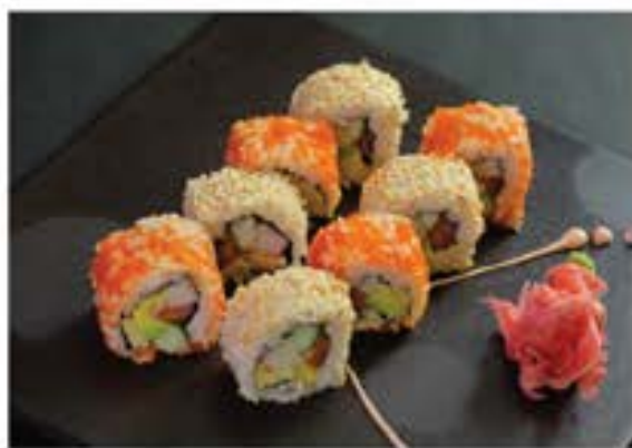
カリフォルニアロール California Roll