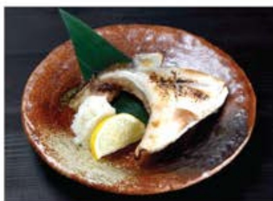
はまちカマ炭火焼 Hamachi Kama Sumibiyaki