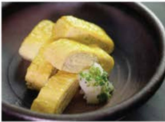
出汁巻き玉子 Dashimaki Tamago 85