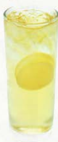
Highball ハイボール 130