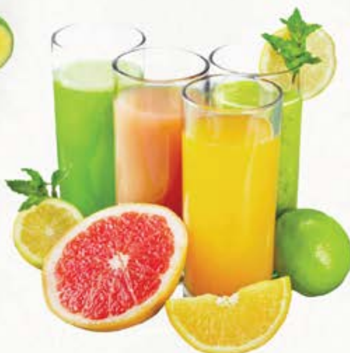
ミックスジュース Mix Juice 85