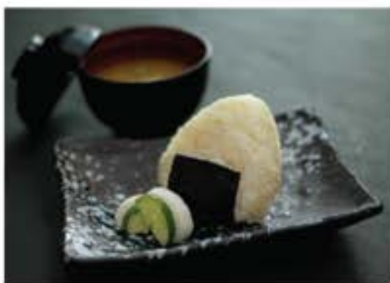
おにぎり 味噌汁付き Onigiri include miso soup