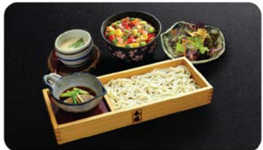
鴨汁そばうどん Kamojiru Soba / Udon