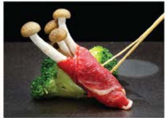
Gyu Kinoko • 牛きのこ