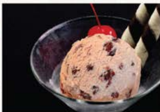
Ogura Ice Cream 小倉アイスクリーム 55