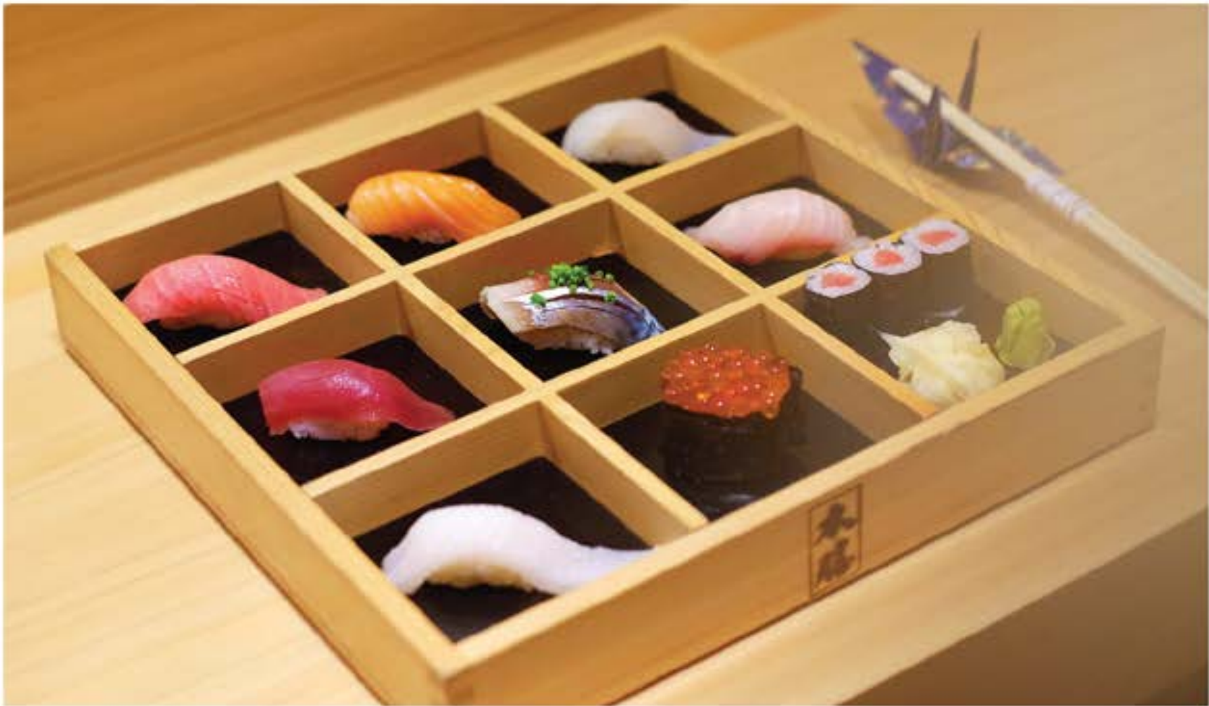
おまかせ握り Omakase Nigiri