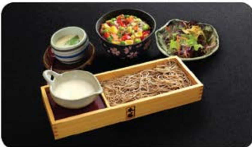
とろろそばうどん Tororo Soba / Udon