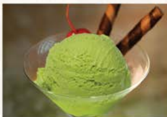
Matcha Ice Cream 抹茶アイスクリーム 70