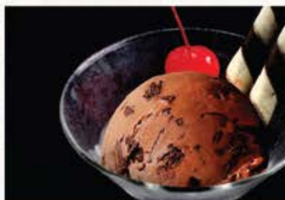
Chocolate Ice Cream チョコレートアイスクリーム 70