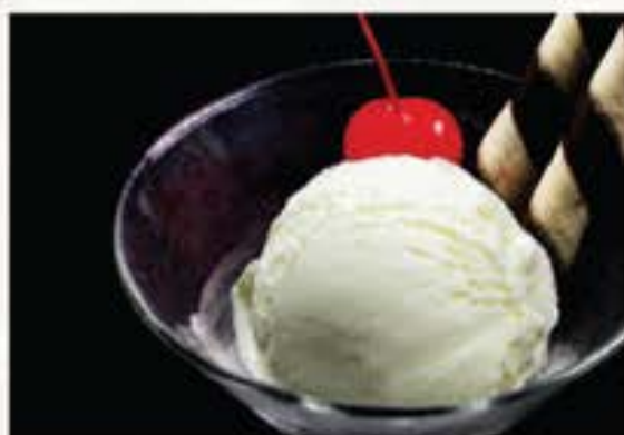
Vanilla Ice Cream バニラアイスクリーム 55