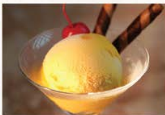
Mango Sorbet マンゴーソルベ 70