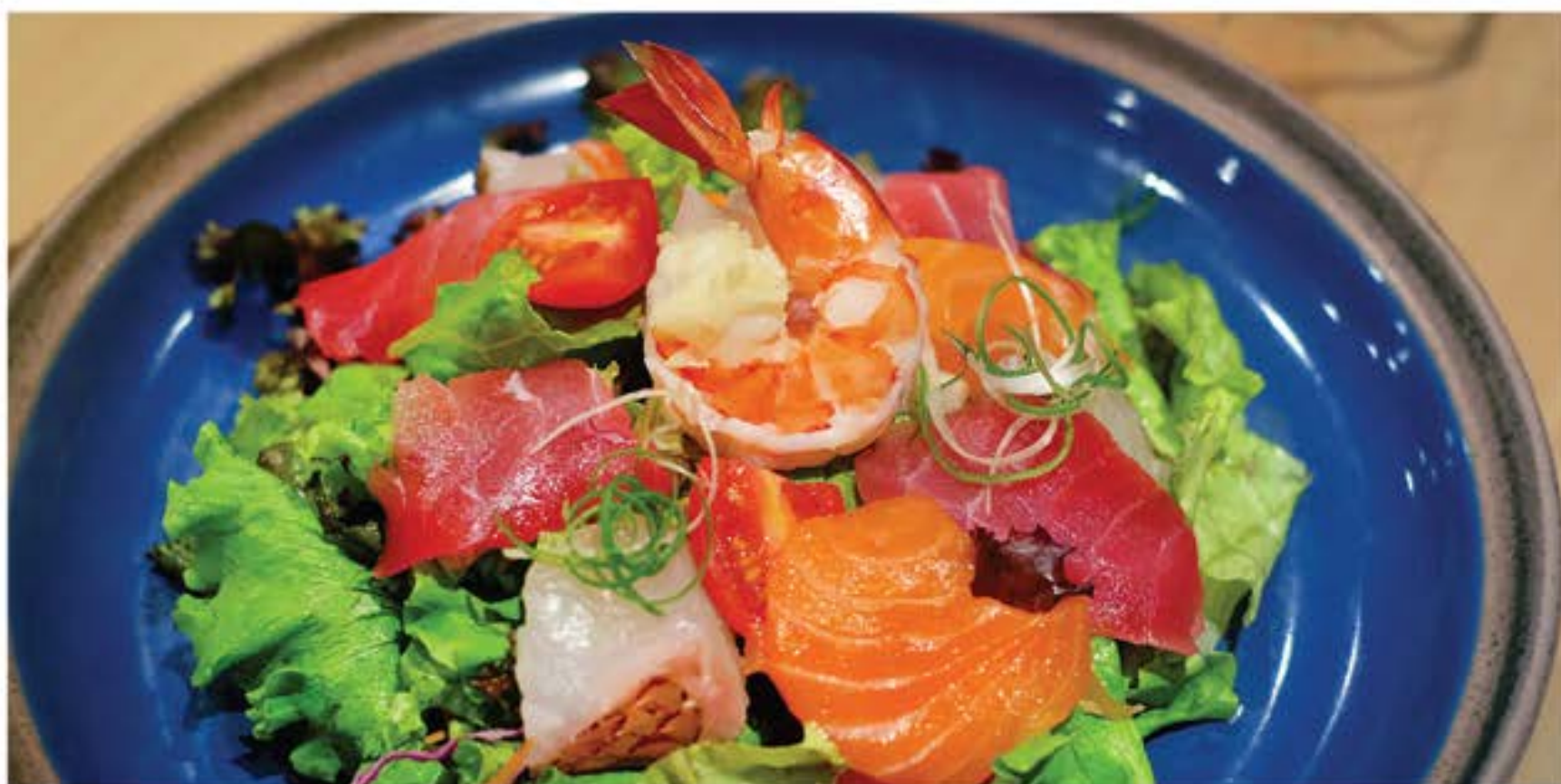
海鮮シーザーサラダ Kaisen Caesar Salad