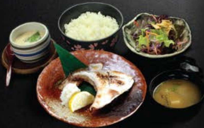
はまちカマ御膳 Hamachi Kama SET

grilled amberjack sickl (fish head) with ponzu served with rice, chawan mushi, salad, miso soup