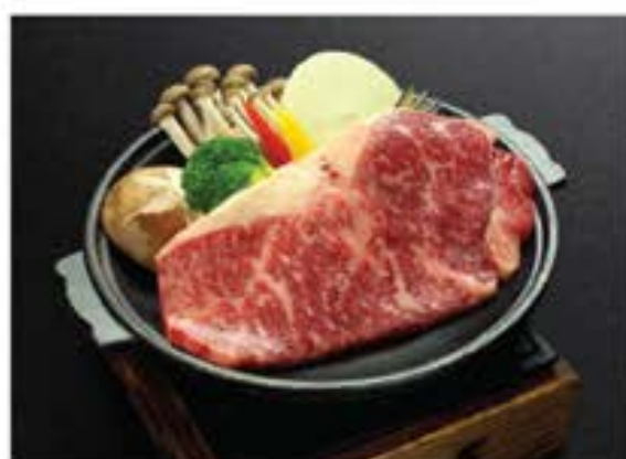
オーストラリア和牛 キノコ添え Wagyu Kinoko Soe 120gram

Sauteed Australian Wagyu served with assorted mushroom