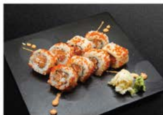
サーモンロール Salmon Roll