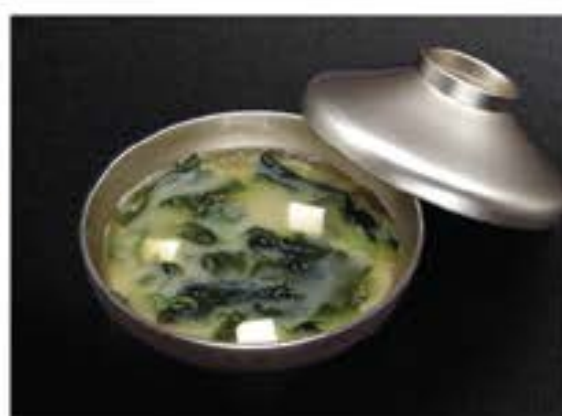
味噌汁 35 Miso Soup