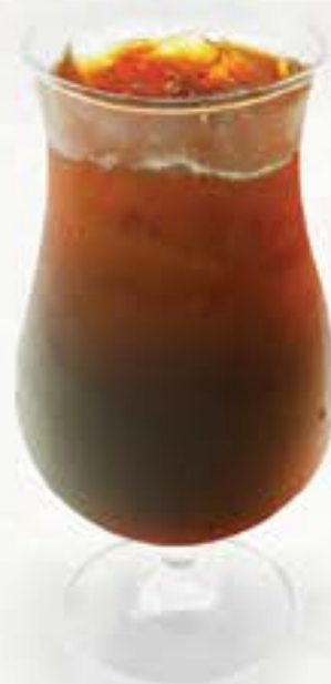
ウーロンティー Oolong Tea 48