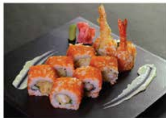
天婦羅ロール Tempura Roll