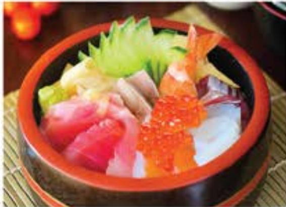
海鮮丼 Kaisei Don 400

*Menu will be made based on ingredients' availability