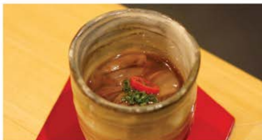
蛍イカ沖漬け Hotaru Ika Oki-dzuke