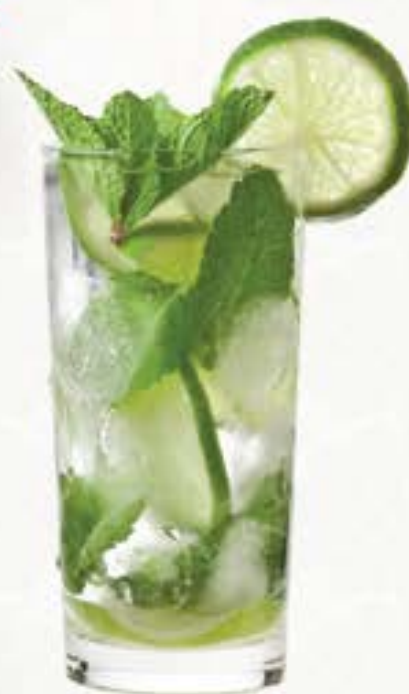
Virgin Mojito バージンモヒート 90