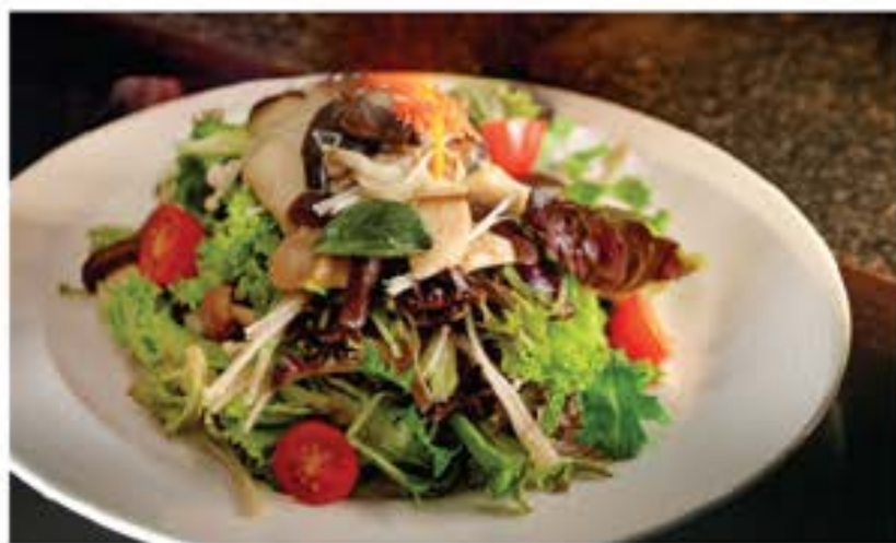
キノコサラダ Kinoko Salad