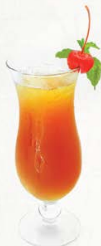
レイシティー Lychee Tea 65