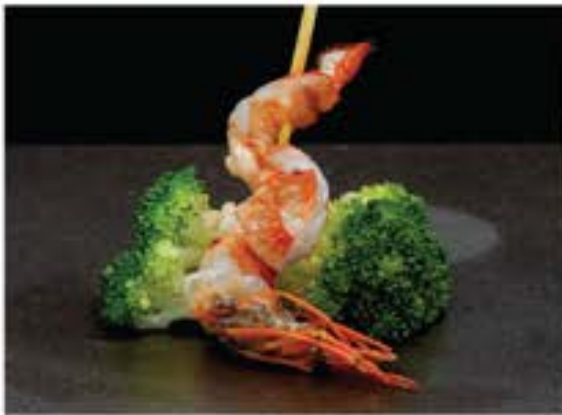
Ebi • 海老