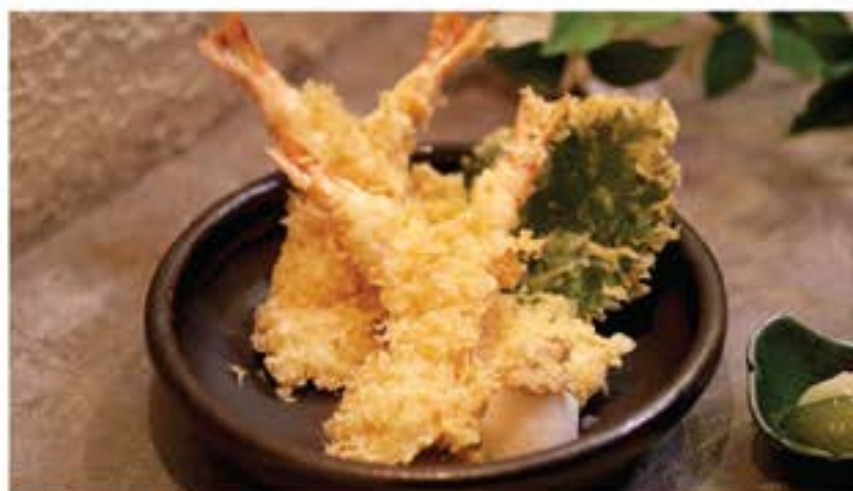
海老天婦羅 Ebi Tempura