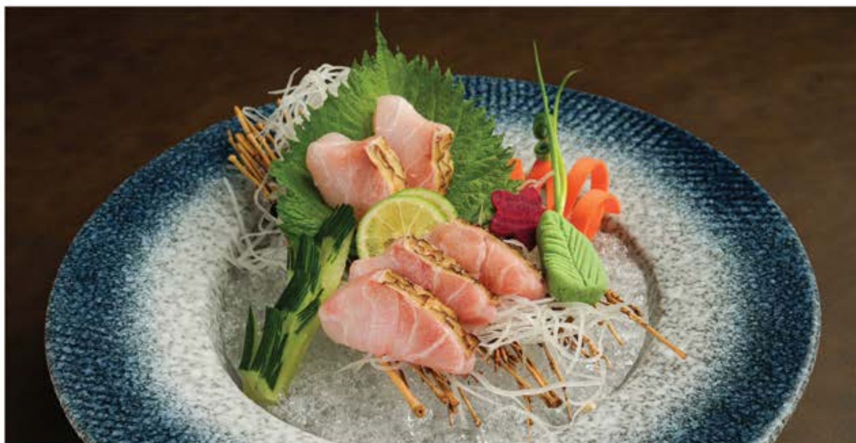
のどぐろ刺身 Nodoguro Sashimi