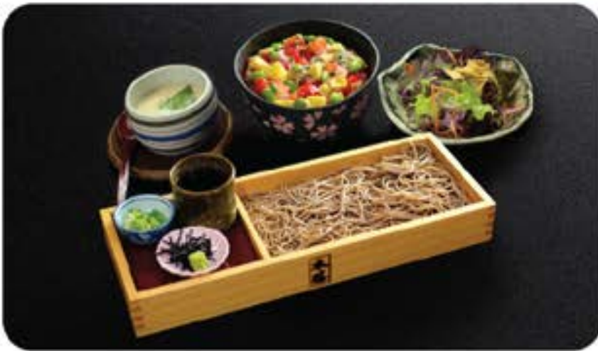
ざるそばうどん Zaru Soba / Udon