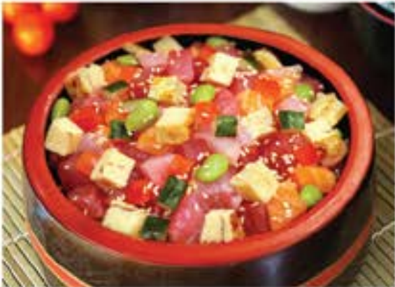
バラちらし Bara Chirashi 305

bowl of rice topped with tuna, salmon and avocado