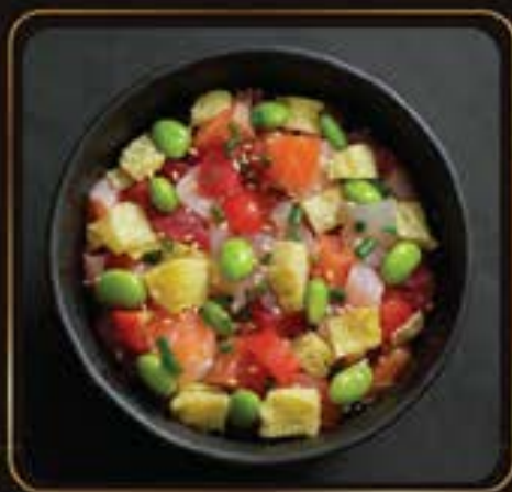
Mini Bara Chirashi