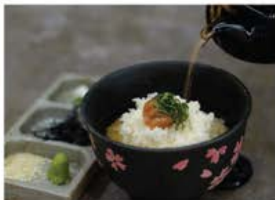
梅茶漬 Ume Chazuke plum and rice with tea broth 55