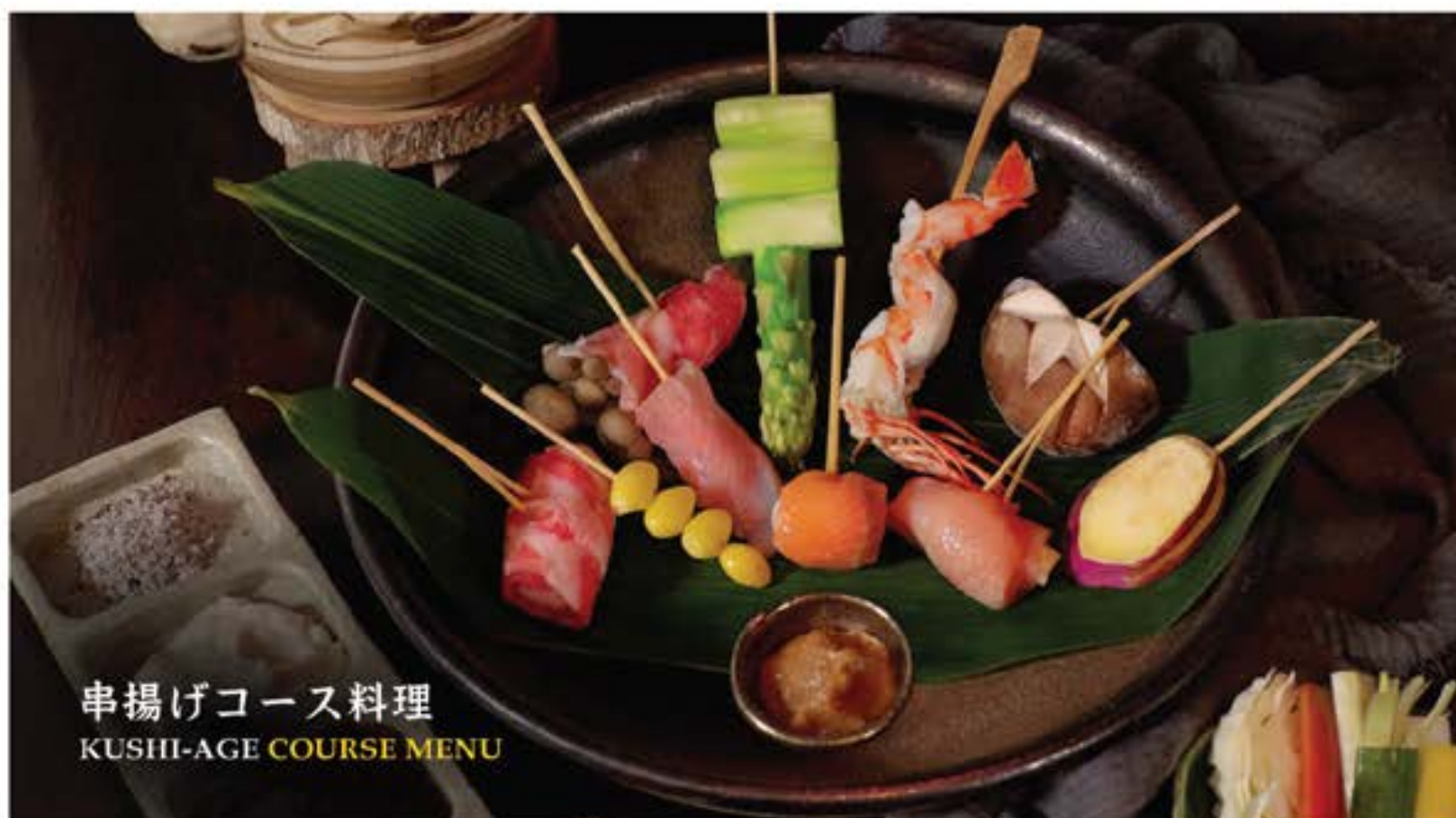
串揚げコース料理 KUSHI-AGE COURSE MENU