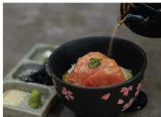
鮪茶漬 Maguro Chazuke tuna and rice with tea broth 105