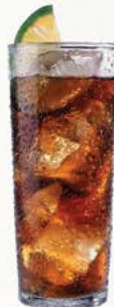
Coke Highball コークハイ 125