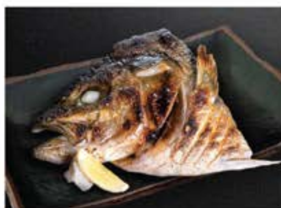
ハマチ・かんぱち兜焼き Hamachi / Kanpachi Kabuto Yaki

grilled amberjack head with sweet soy sauce