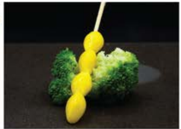
Ginnan • 銀杏