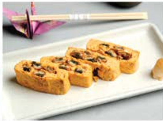
うな玉焼き Una Tamago Yaki 275