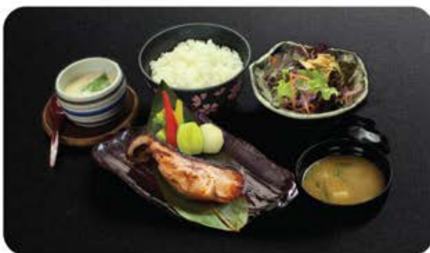
銀だら西京焼き Gindara Saikyoyaki SET

grilled silver cod marinated with miso served with rice, chawan mushi, salad, miso soup