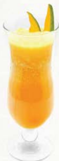
マンゴー Mango Juice 85