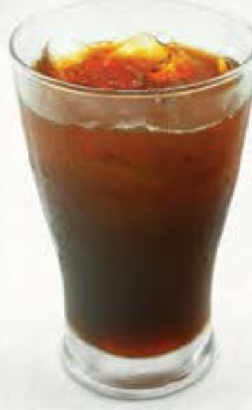
Rich Oolong Tea High 煮だしウーロンハイ 135