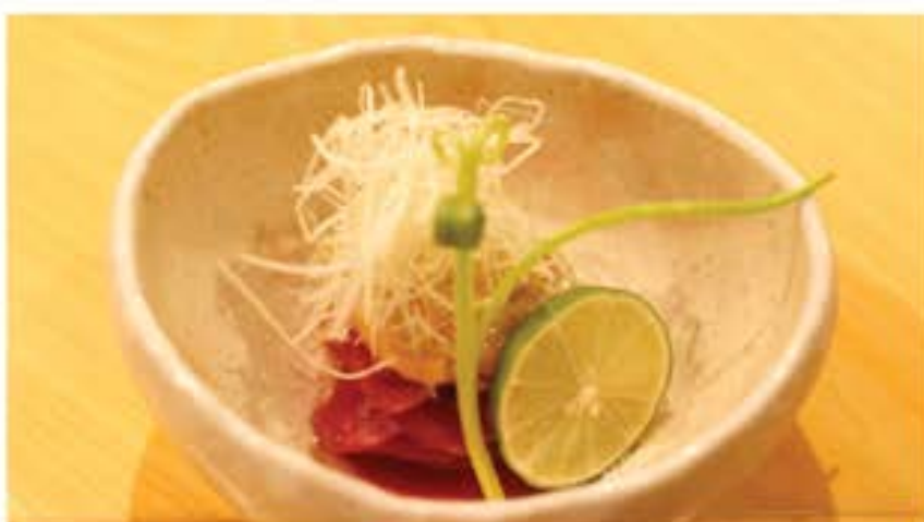
マグロ酢味噌がけ Maguro Sumiso