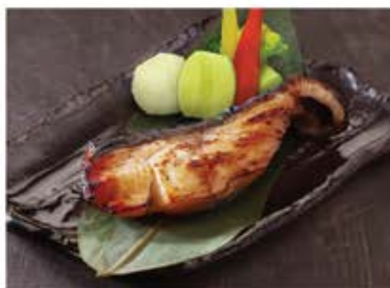
銀だら西京焼き Gindara Saikyoyaki