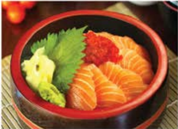
サーモンちらし Salmon Chirashi 370

bowl of rice topped with tuna, salmon and avocado