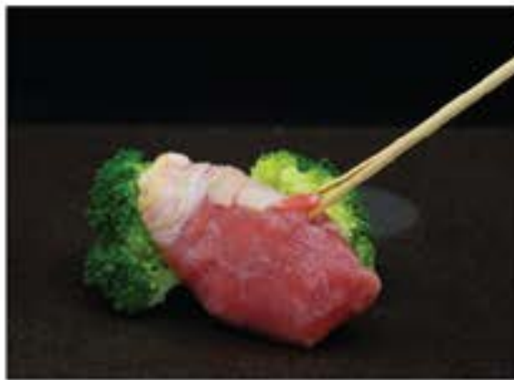
Gyurose • 牛ロール