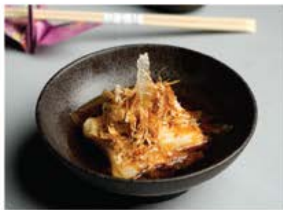
揚げ餅 Age Mochi 85