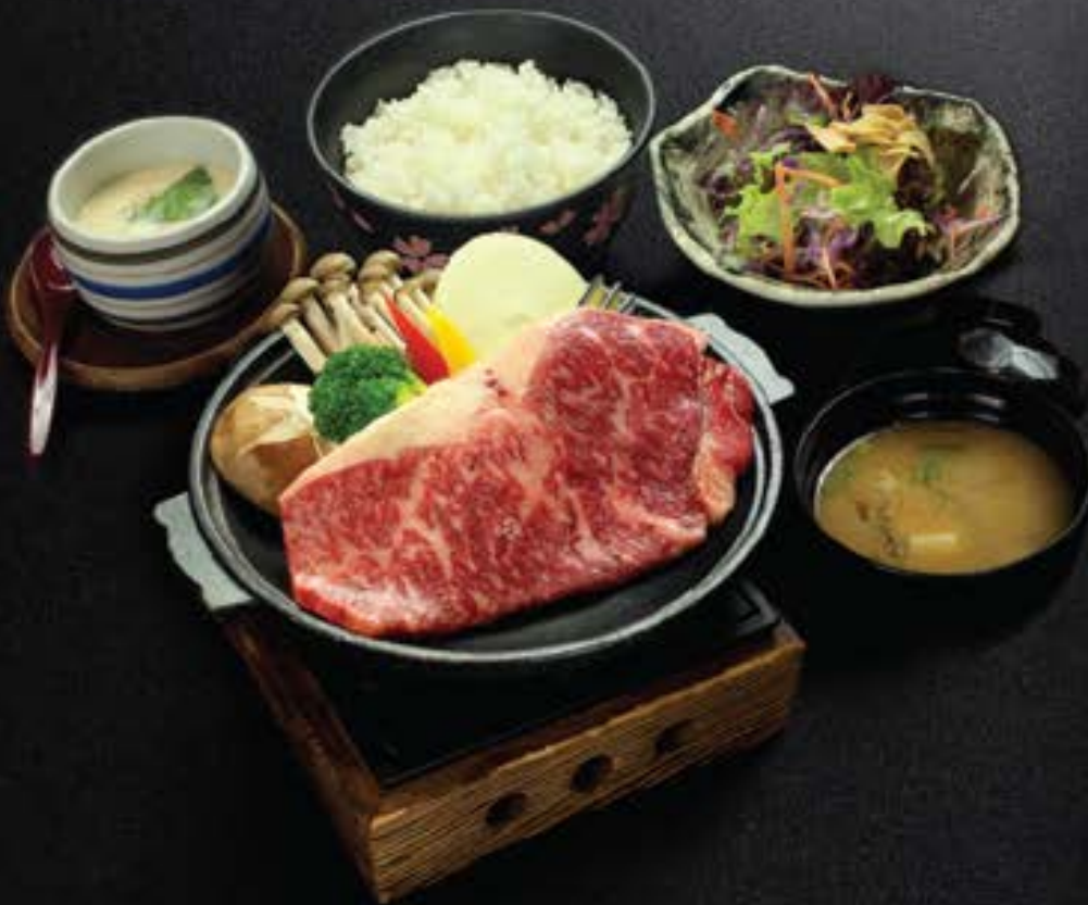
和牛 キノコ添え御膳 Wagyu Kinoko Soe SET