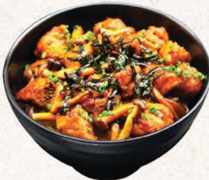
Tonkoro Steak Don