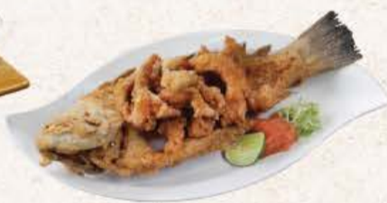
Karei Karage 90**