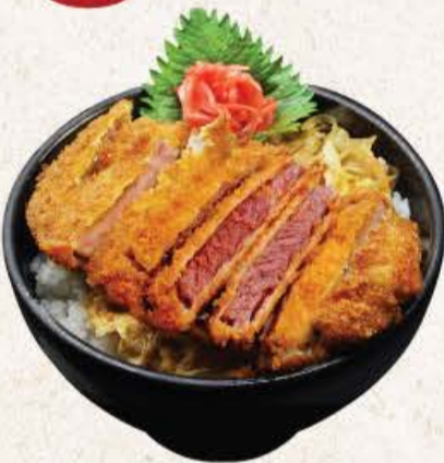
Gyu/Chicken Katsu Don