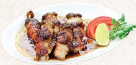
Buta Kinoko Maki 75**

冷しゃぶ ポン酢・胡麻 cold pork shabu-shabu with ponzu / sesame sauce