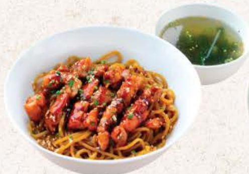
Teriyaki Ramen 80 ++

牛トリュフラメン sauteed beef with truffle sauce and half boiled egg on top of ramen