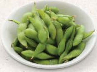
Edamame 35 ++