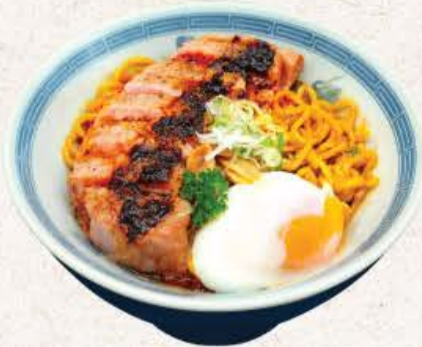
Gyu Truffle Ramen 110 ++

牛トリュフラメン sauteed beef with truffle sauce and half boiled egg on top of ramen