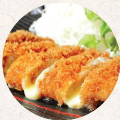
Senmai Katsu Cheese 105**

千枚カツチーズ deep fried pork sirloin cutlet with mozzarella cheese filling