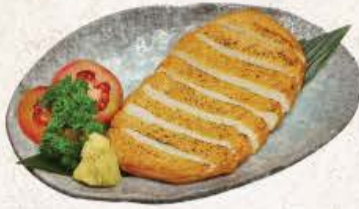
Satsuma Age 48 ++