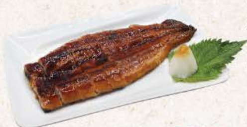
Unagi Kabayaki 230**