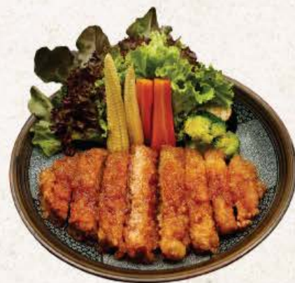
Beef Teriyaki 110**

ビーフ焼肉 sauteed Australian beef with yakiniku sauce