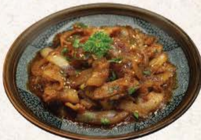
Buta Shoga Yaki 90**

豚野菜炒め sauteed pork with assorted vegetables