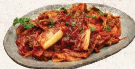
Buta Kimchi Itame 90**

豚生姜焼き sauteed pork belly with ginger sauce