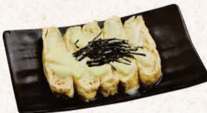
Dashimaki Tamago Cheese 65 ++