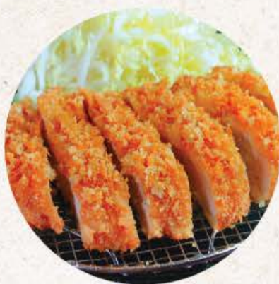
Rosu Katsu 95**

千枚カツチーズ deep fried pork sirloin cutlet with mozzarella cheese filling