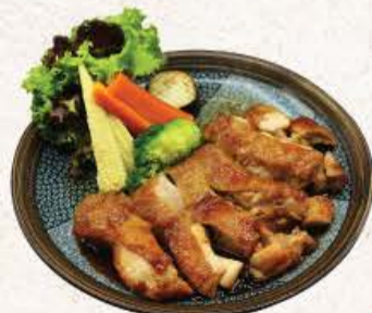
Chicken Teriyaki 80**