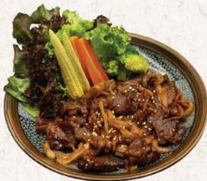
Beef Yakiniku 110**

サイコロステーキ dice-cut beef steak with vegetables