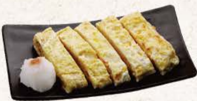
Dashimaki Tamago 55 ++