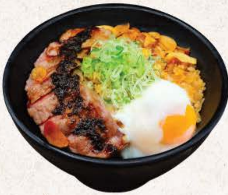
Gyu Truffle Don