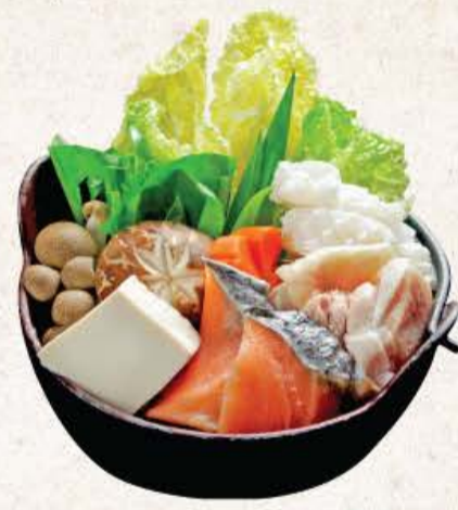
Ishikari Nabe 98 ++