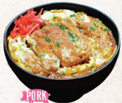
Senmai Katsu Cheese Don