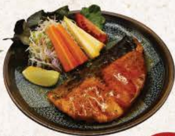
Salmon Teriyaki or Shioyaki 125**