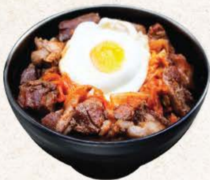
Rafute Kimchi Don