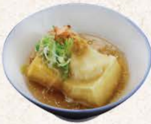
Agedashi Tofu 45 ++