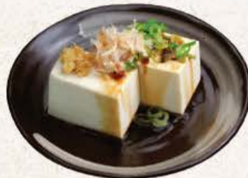
Hiyayako 35 ++