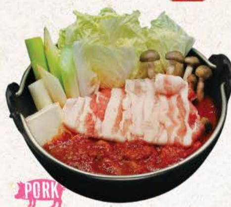
Buta Kimchi Nabe 98 ++