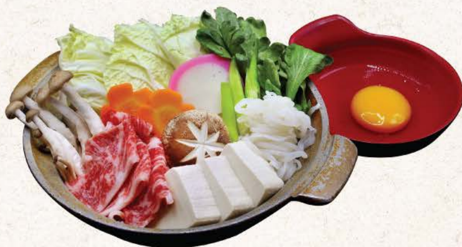
Sukiyaki Nabe 98 ++