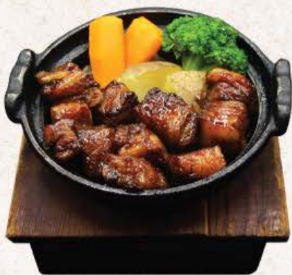
Saikoro Steak 125**

サイコロステーキ dice-cut beef steak with vegetables