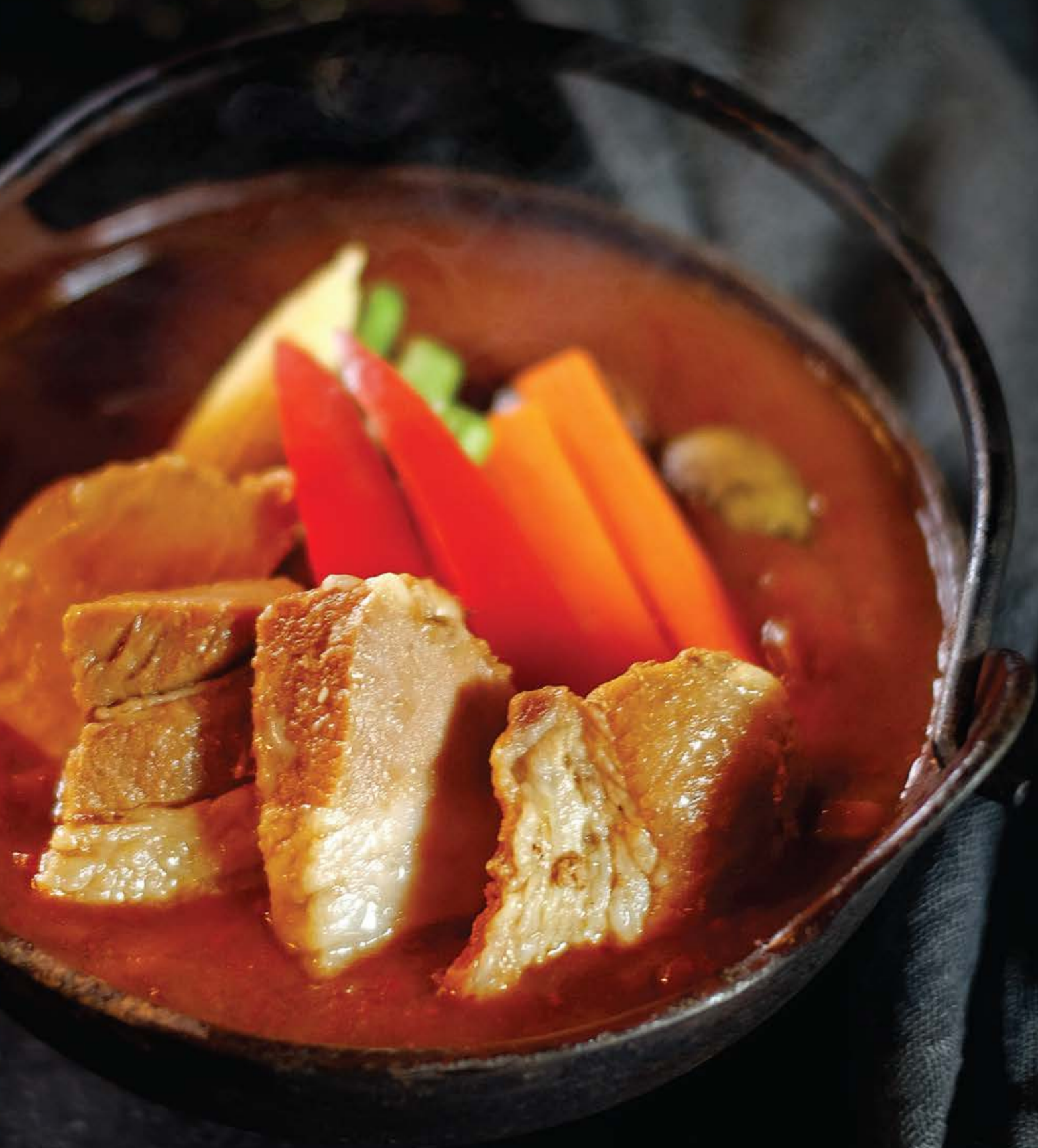
豚スープカレー Pork Soup Curry