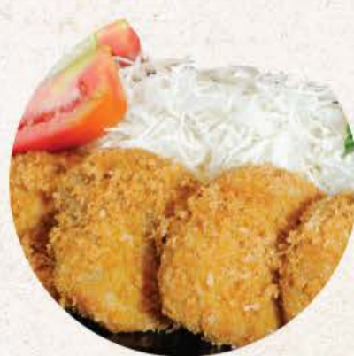
Hire Katsu 95**