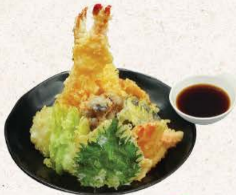
Tempura Mori 103 ++

天ぷら盛り assorted deep fried prawn and vegetables