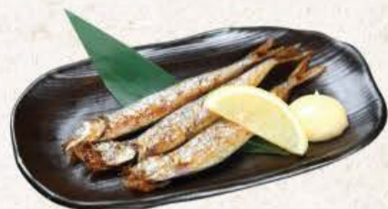
Shishamo Yaki or Karage 65**

grilled salmon with teriyaki sauce / salt