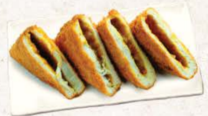
Curry Pan 60 ++