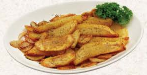
Garlic Fried Potato 45 ++