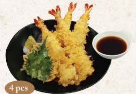
Ebi Tempura 115 ++

天ぷら盛り assorted deep fried prawn and vegetables