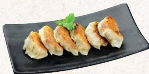
Chicken Yaki Gyoza 70**

fried chicken cutlets with sweet teriyaki sauce