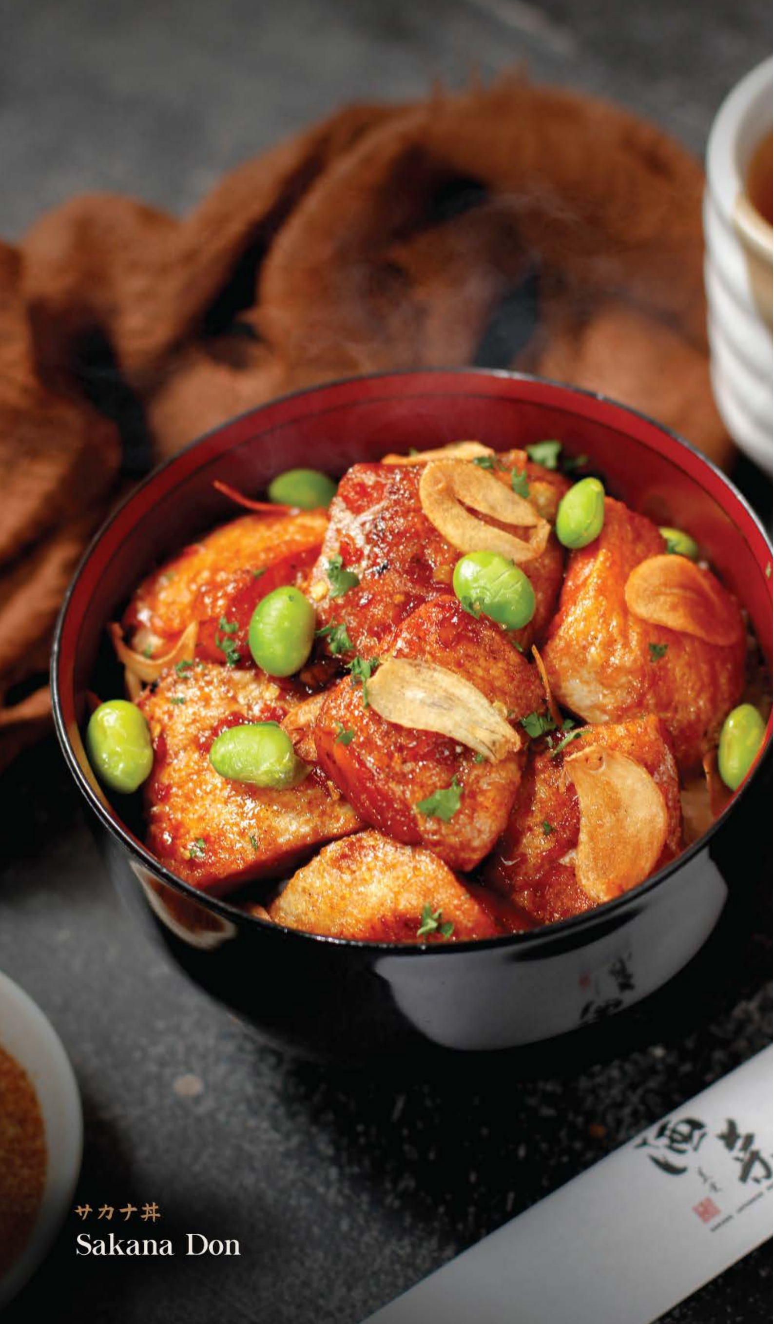
サカナ丼 Sakana Don