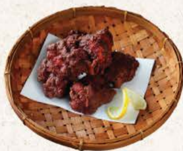
Spicy Chicken 70**