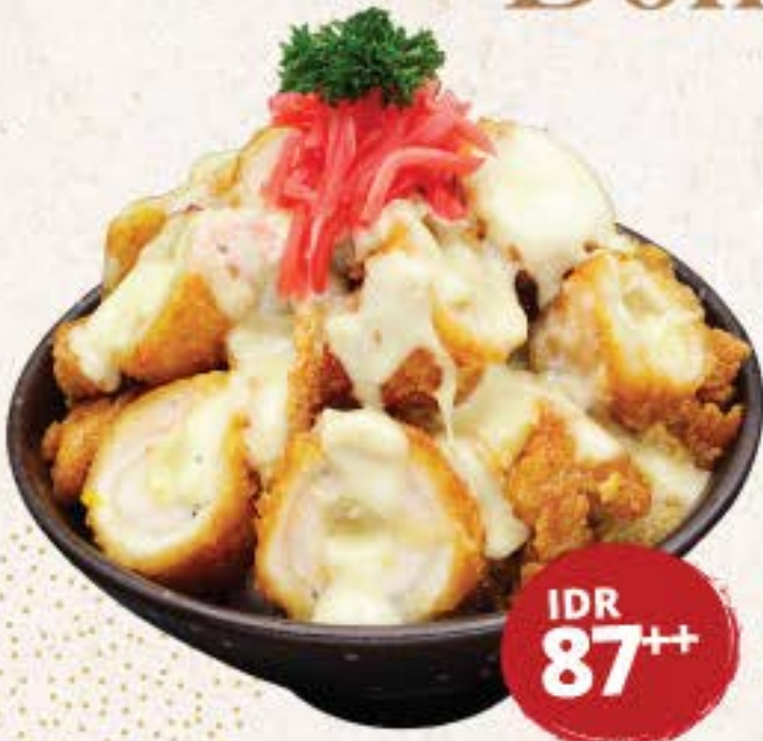
とろけるチーズチキン丼 Torokeru Chizu Chicken Don

melted mozzarella cheese wrapped in tender chicken coated in breadcrumbs with sweet and savory sauce topped with creamy cheese sauce.