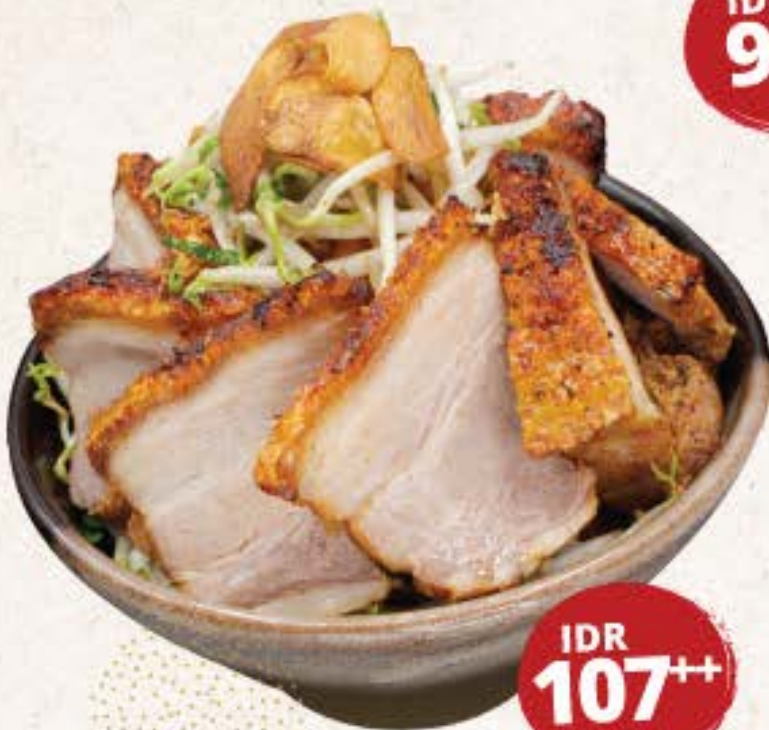
パリ皮ポーク丼 Pari Kawa Pork Don

thick slices of pork belly with crispy skin & tender meat, served with a tangy, sweet, and slightly spicy sauce.