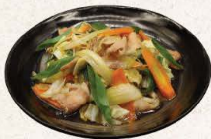
Buta Yasai Itame 90**

豚野菜炒め sauteed pork with assorted vegetables