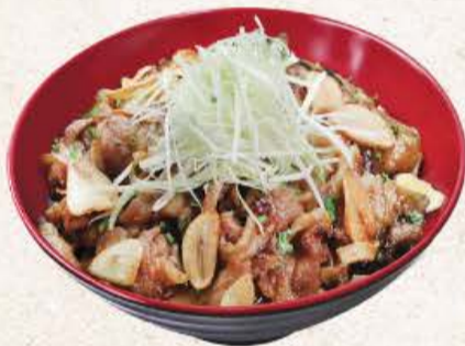
Original Genki Don