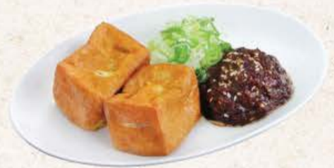
Atsuage 40 ++