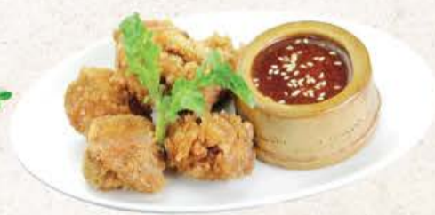
Buta Karage Kaimi Sauce 68**

豚唐揚げ怪味ソース deep fried pork belly with original sauce