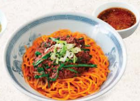
Kara Tan Men 80 ++

照焼きラーメン ramen with chicken teriyaki on top