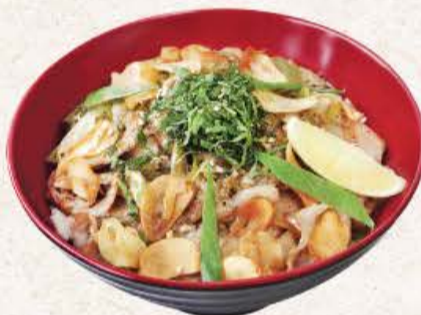
Motto Genki Don