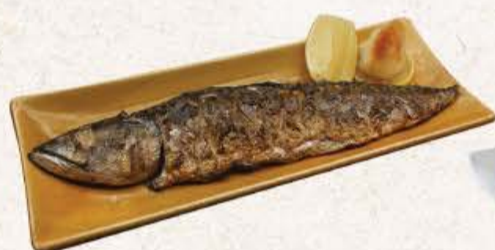
Saba Shioyaki 95**