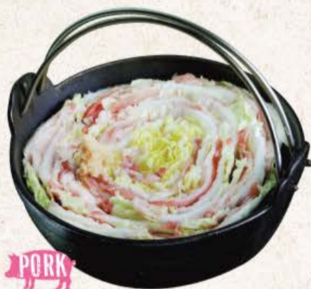
Buta Hakusai Nabe 98 ++