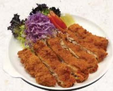
Chicken Katsu 75**