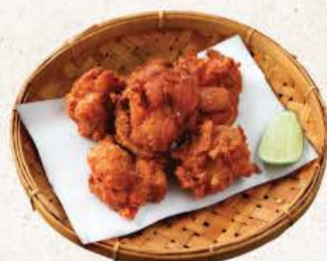
Chicken Karage 70**