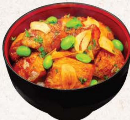
Sakana Don Original / Spicy