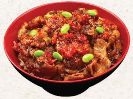
Cho Genki Don