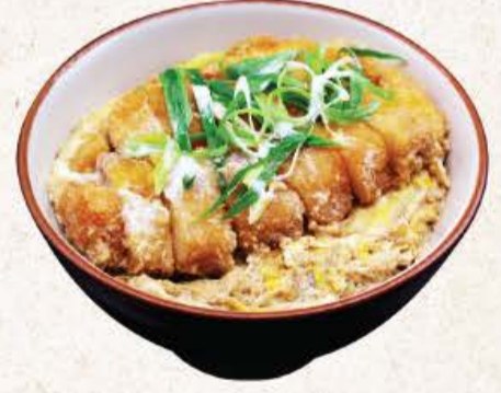
Pork Katsu Don