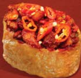
フルダクチキン CHICKEN BULDAK spicy fire chicken and sushi rice wrapped in tofu skin