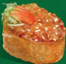
中華クラゲ CHUKA KURAGE marinated jellyfish and sushi rice wrapped in tofu skin