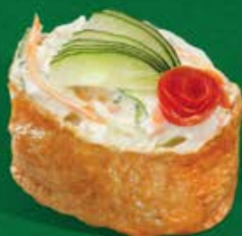
カニマヨ KANI MAYO creamy crab stick with mayonnaise and sushi rice wrapped in tofu skin