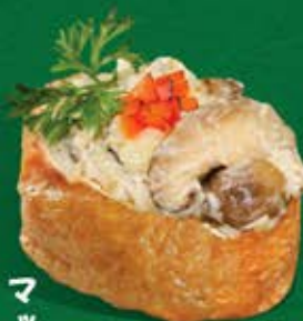
マッシュルーム CREAMY MUSHROOM creamy shiitake and sushi rice wrapped in tofu skin