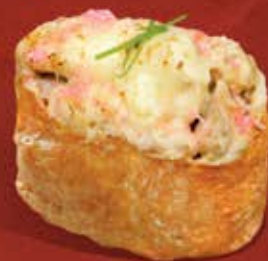
チキンチーズ CHICKEN CHEESE chicken and sushi rice with cheese topping wrapped in tofu skin