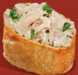
ツナマヨ TUNA MAYO tuna with mayonnaise and sushi rice wrapped in tofu skin