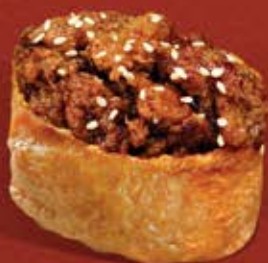
ビーフ照り BEEF TERI beef teriyaki and sushi rice wrapped in tofu skin