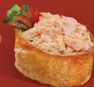
サーモンマヨ SALMON MAYO salmon with mayonnaise and sushi rice wrapped in tofu skin