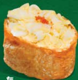
たまごサラダ TAMAGO SALAD mashed boiled egg, with mayonnaise and sushi rice wrapped in tofu skin