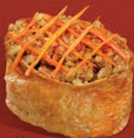
ビーフそぼろ BEEF SOBORO seasoned ground beef and sushi rice wrapped in tofu skin